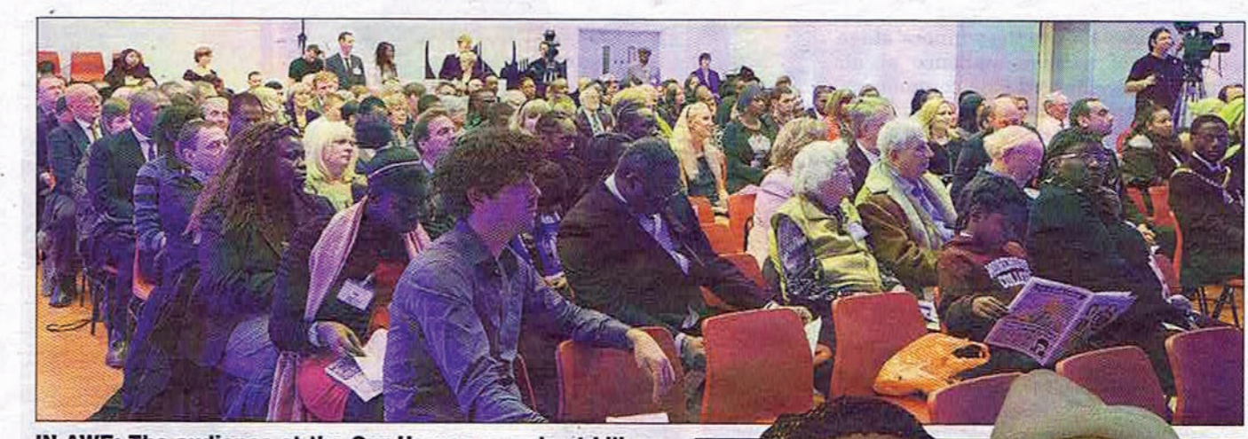
IN AWE: The audience at the Our Heroes awards at Lilian Baylis Technology School in Kennington