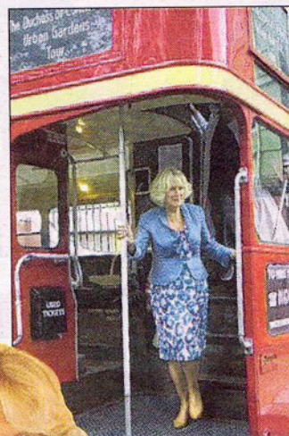
Laugh... Camilla on gardener tour

Although it began without official consent, most guerilla gardeners' efforts are now accepted by public bodies. And Royals, it seems.