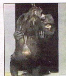
Hug of joy... chimps